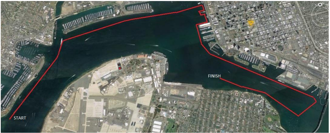
PARADE STAGING AREA